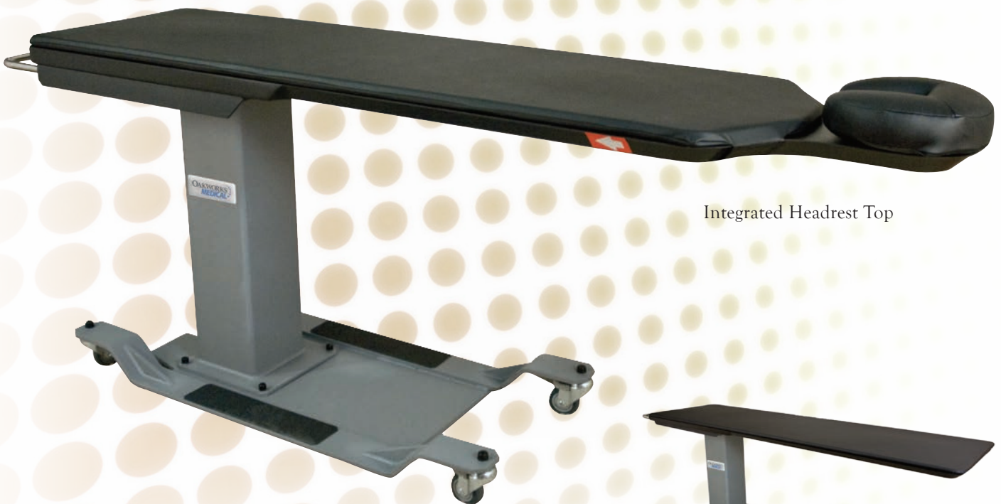
Integrated Headrest Top