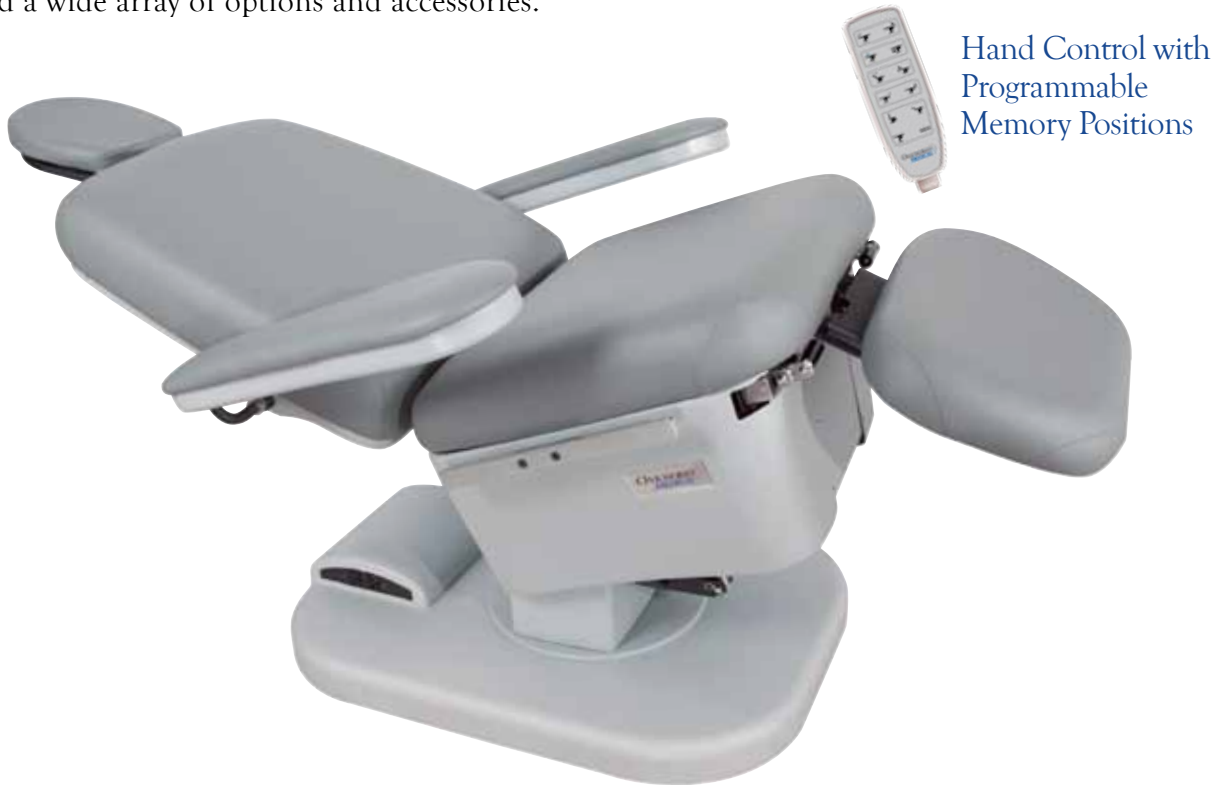
Hand Control with Programmable Memory Positions

The 300 Series Procedure Chair gives you the accessibility, positioning and patient comfort for a wide range of procedures in a compact and aesthetically pleasing package. This power chair features all electric movements with memory presets and a wide array of options and accessories.