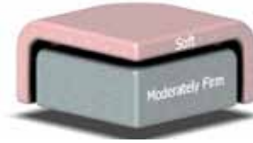
3" Comfort Foam™ More comfort and support