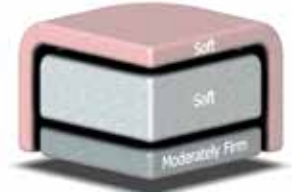
4" Comfort Foam™ Superior comfort and support