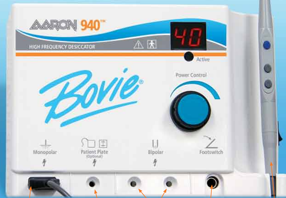
Hand Control For Low & High Power