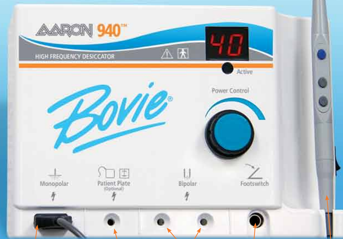
Hand Control For Low & High Power