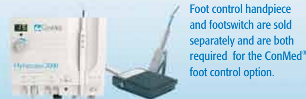
Foot control handpiece and footswitch are sold separately and are both required for the ConMed® foot control option.

Additionally, the Hyfrecator's setup is much more complicated. "Time is money" and the six cumbersome steps it takes to change the Hyfrecator® 2000 from the 3-button handpiece to foot control can deplete both these valuable assets. Also note that the 6-steps must be reversed in order to go back to 3-button handpiece control.