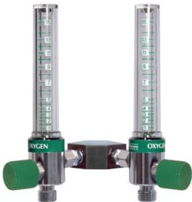
Dual Flowmeter Assembly