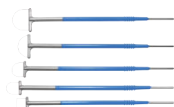
Lletz Loop Electrodes †