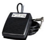
A803 Footswitch †