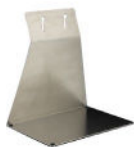
A813 Table Top Stand †