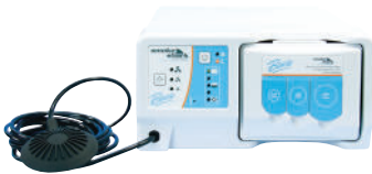
SE02 Smoke Evacuator †