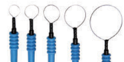
Disposable Dermal Loops †