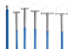
Disposable LLETZ/LEEP Loop and Ball Electrodes †