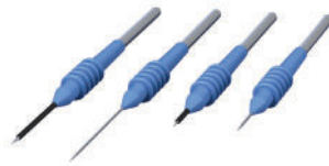
Disposable SuperCut™ Needles Electrodes †