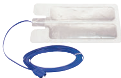
ESREC - Split Disposable Return Electrode with cord †