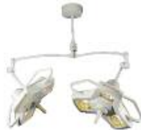
AIM-100™ Dual Ceiling