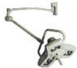
AIM-100™ Wall Mount