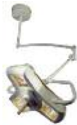
AIM-100™ Single Ceiling