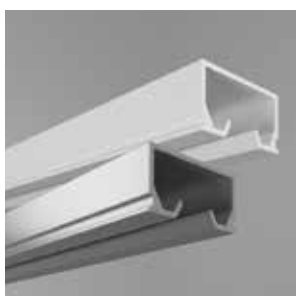
OPTITRAC® CUBICLE TRACK

Here are the Inpro components that make up the ideal shower system: