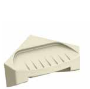
BIOPRISM® SOAP DISHES