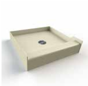
BIOPRISM® SHOWER RECEPTOR