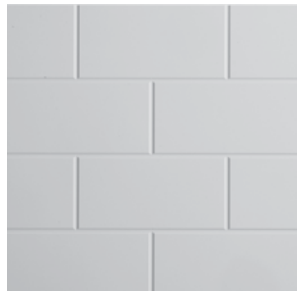
BIOPRISM® SHOWER SURROUND