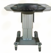
LATERAL TRAVEL CFPM401