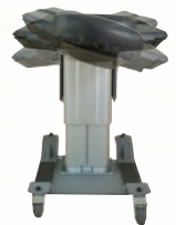
LATERAL TILT CFPM400