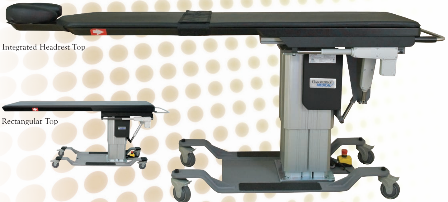
Integrated Headrest Top