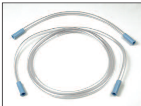
Suction Tubing Kit