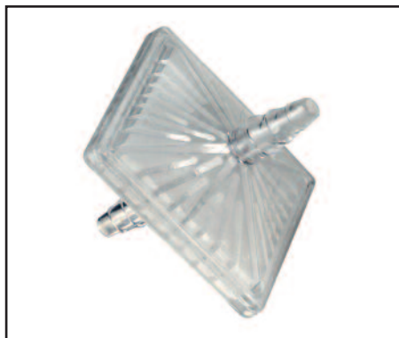
Disposable Hydrophobic/Bacteria Filter