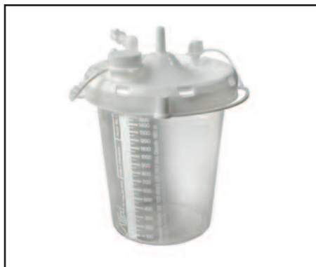
Disposable Collection Canister