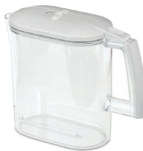
Extra Tritan™ BPA-FREE Carafe PN# 3250