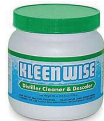
Kleenwise™ Distiller Cleaner and De-Scaler PN# KSD

Tuttnauer Innovation · Legacy · Partnership