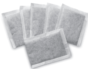
6-Pack Certified Carbon Filter Bags PN# 8606